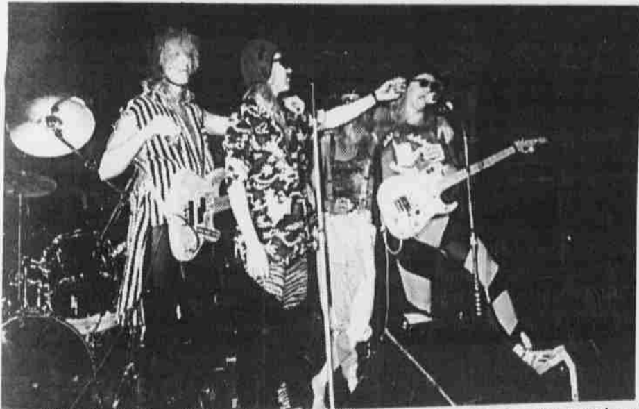
AT IT AGAIN — The Point hosts kamikaze shots at the Villager, this weekend

Carrack's pleasant voice makes his slow songs more appealing than the faster ones. yet, the lyrics remain clear throughout the album.