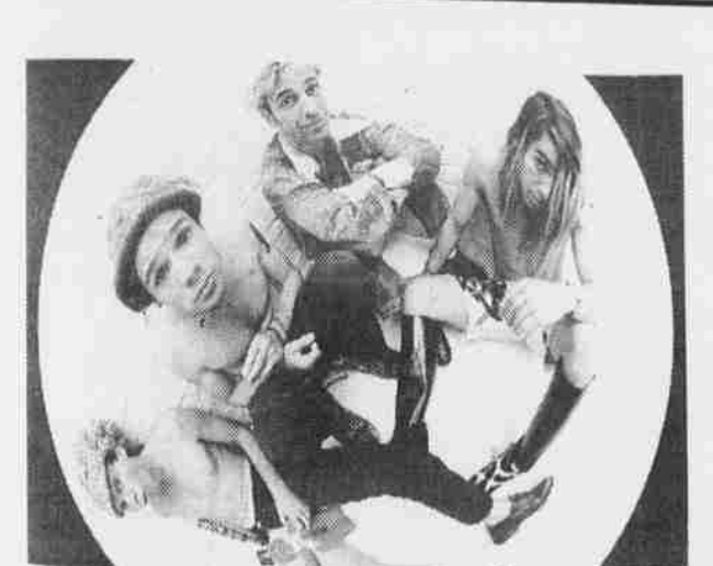
RED HOT CHILI PEPPERS The Uplift Mofo Party Plan EMI-Manhattan