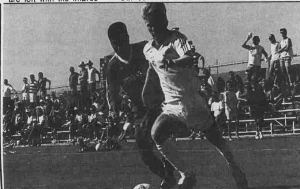
DRIBBLING REBEL — The seventeenth ranked UNLV soccer team will face Cal State Fullerton, Sunday at 1pm at Peter Johann Field.