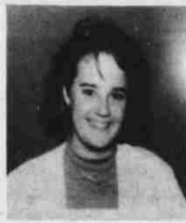
Jody Wright Hotel

Staying at a cabin in Lake Tahoe with about 30 friends and seven kegs.