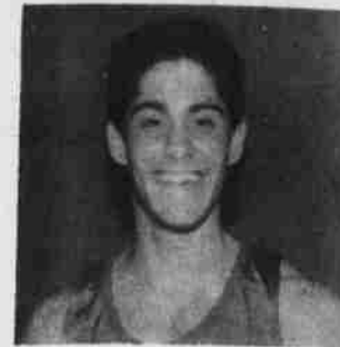
David Abramowitz Hotel

To take a rest and possibly tour parts of California.