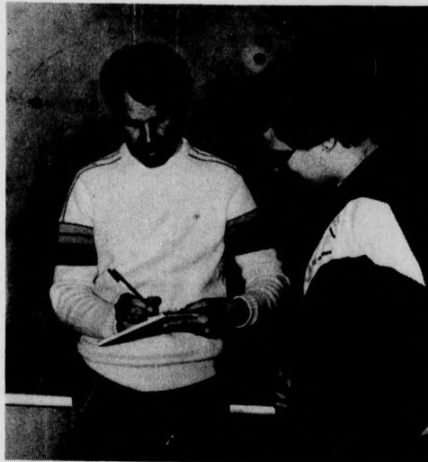
SIGNING AUTOGRAPHS — Impresionist Rich Little takes time to sign autographs after lecturing for Joe Delany's Hotel Entertainment class.

For more information, call the UNLV Music Department at 739-3332.