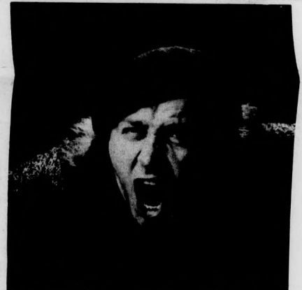
SAM "THE SCREAMER" KINISON — will perform at Artemus Ham Hall, Saturday, March 14, 7:30.

KLSQ airs 24 hours a day and we should see more stations with this format arriving in town.