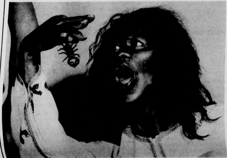
MMMMM, THAT LOOKS TASTY—Morroccan street begger makes his living eating scorpions for money, and gets some extra protein in the bargain.

The animal world is well represented by features like the three-legged horse. There are also exhibits honoring torture devices of the middle ages [in- the world's smallest camera. The Ripley's Believe It Or Not Museum is an attraction that will appeal to all ages. If you're ever downtown, visit the mus-