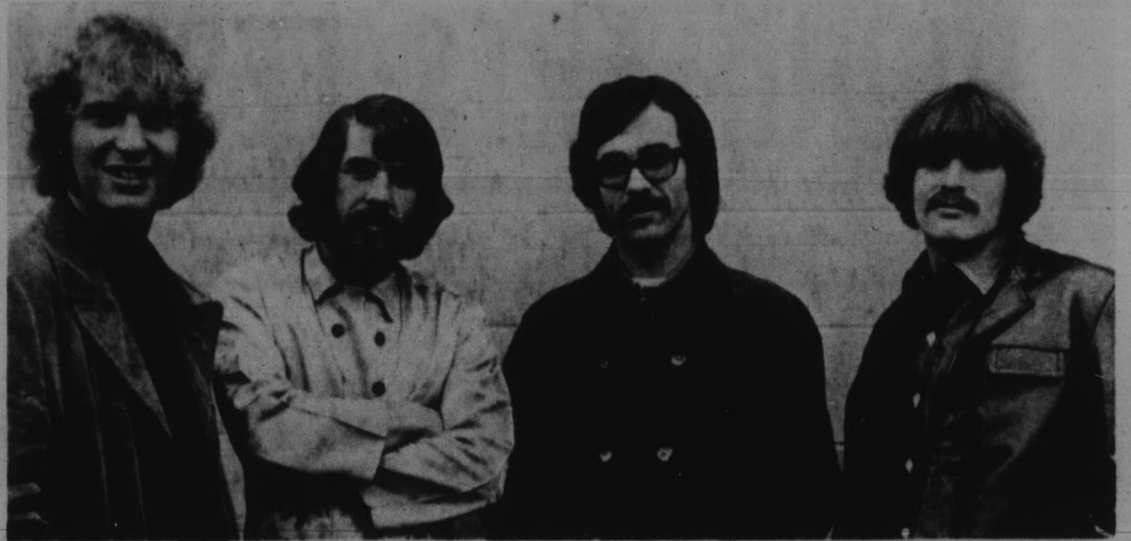
Creedence Clearwater Revival