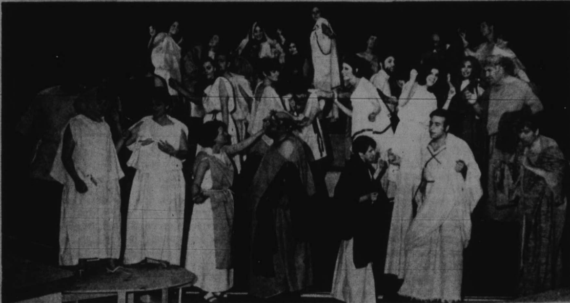
Members of cast in "Lysistrata"