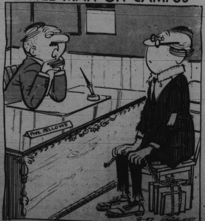
"IT MUST BE A SOURCE OF GREAT PERSONAL SATISFACTION FOR YOU TO LEARN THAT THE FACULTY HAS UNANIMOUSLY ASKED ME TO APPOINT YOU TO HEAD THE SALARY COMMITTEE."