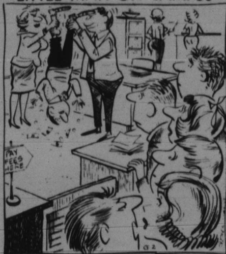
"I'LL BET THEY RAISED TH TUITION AGAIN THIS YEAR."