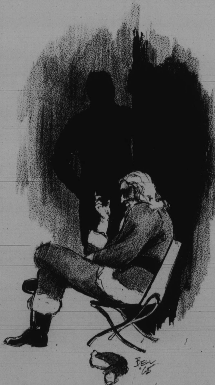
"And then that damni kid asked me what Christ had to do with me and Christmas."