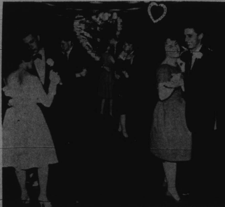
Romantic couples swayed (and twisted) to the music at the A. W. S. Valentines dance which was held at the Municipal Country Club on Feb. 10.

Stock Clerk Off Campus Driver On Campus "Draped" Model for Art Class Off Campus Controlled Interviewers Male or Female On Campus Male or Female Male or Female