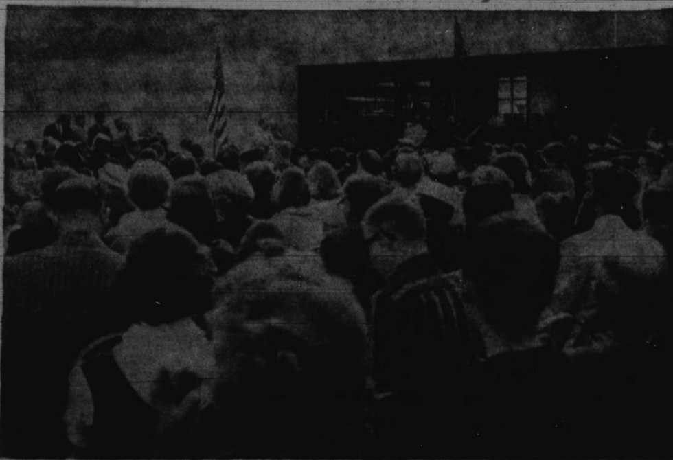
A small portion of the large crowd that attended the recent cornerstone ceremonies for the first building on the new Nevada Southern University campus are pictured above. More than 1000 visitors attended the rite which was conducted by the Masonic Lodge of Nevada.