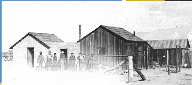
McWilliams townsite 1904

The Pioneer Trail is the vision of the West Las Vegas community that wanted to celebrate the history of West Las Vegas and the early pioneers that settled the area and contributed to its culture and heritage. A community group was formed to interview long-time residents and research the history of the area. The result was an extensive oral history collection and access to photographic archives that wove a tale of dreams realized and lost, civil rights victories, speakeasies and the development of a strong community, ethnically diverse and culturally rich.