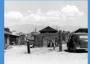
Monroe Avenue 1943

The Pioneer Trail leads visitors through the area where the development of early Las Vegas truly began. As you travel from site to site, you will gain a sense of the adventurous spirit of those men and women who contributed to the growth and cultural heritage of the valley. And you will leave with an understanding of the extreme difficulties of making a life in this once-barren desert.