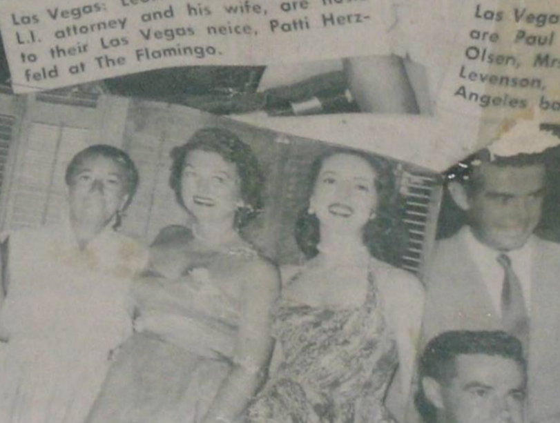
Las Vegas: At The Gay 90s Bar, Mary Kaye is congratulated by Gloria de Haven, Frances Faye, Ginny Simms, and Lisa Kirk, for her outstanding success at the popular bistro.