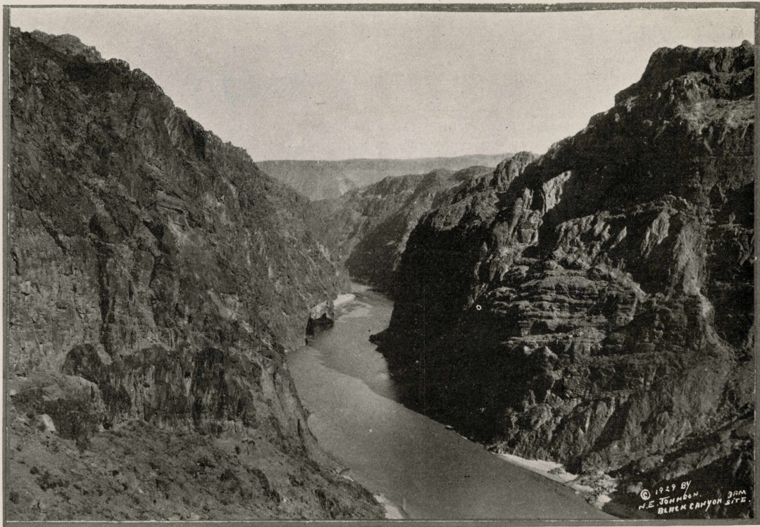
The Black Canyon Dam Site looking up stream