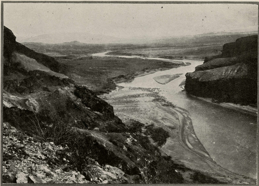
Lake site where water is to be backed up from Boulder Canyon Dam