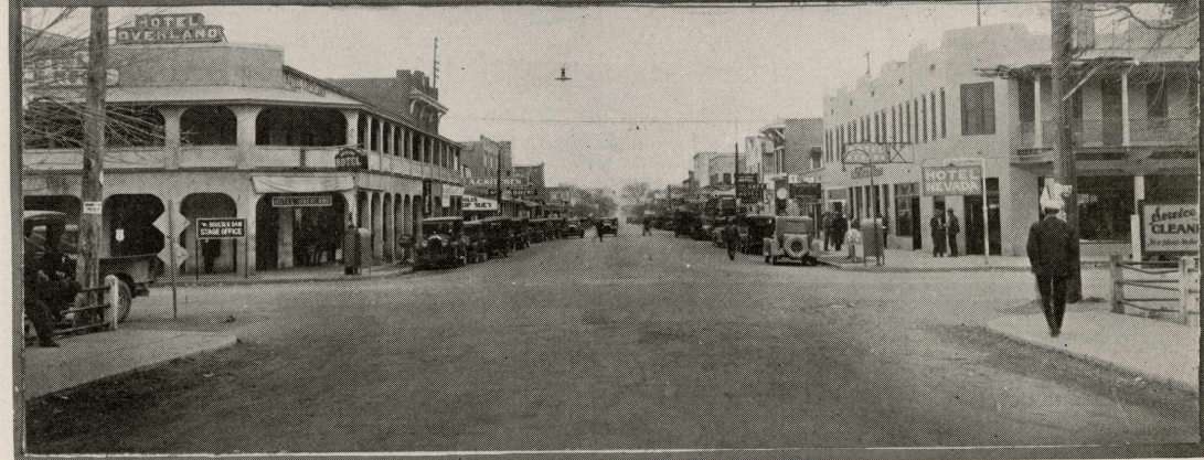
Freemont Street, 1905 Las Vegas