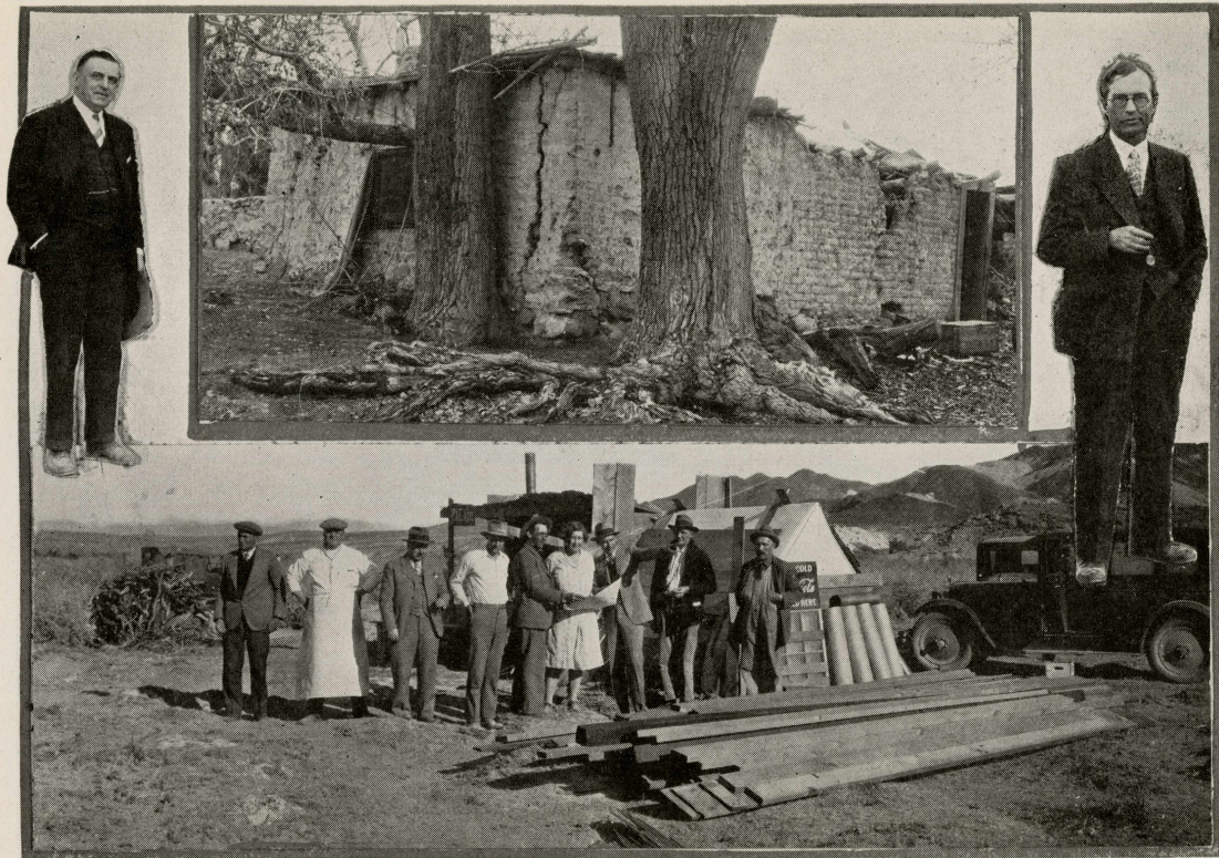
Old Adobe Fort, Las Vegas Built by the Mormons about 1850