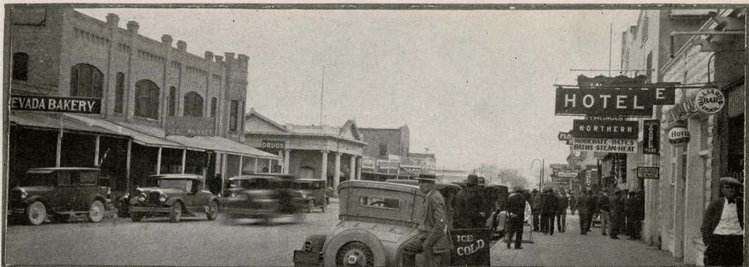
Street Scene, Las Vegas, Nev.