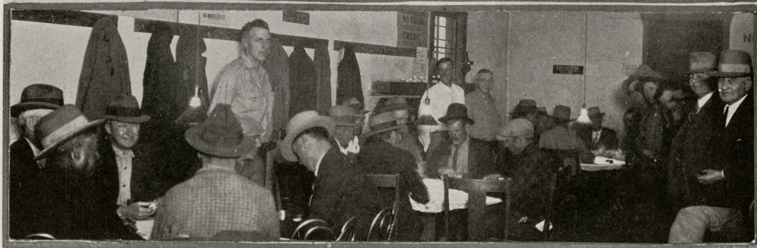
Gambling Scene, Las Vegas, Nev.