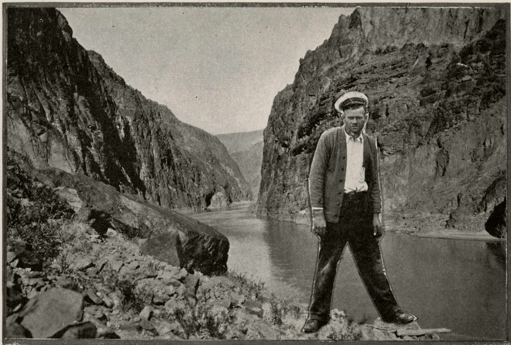
The Black Canyon Dam Site