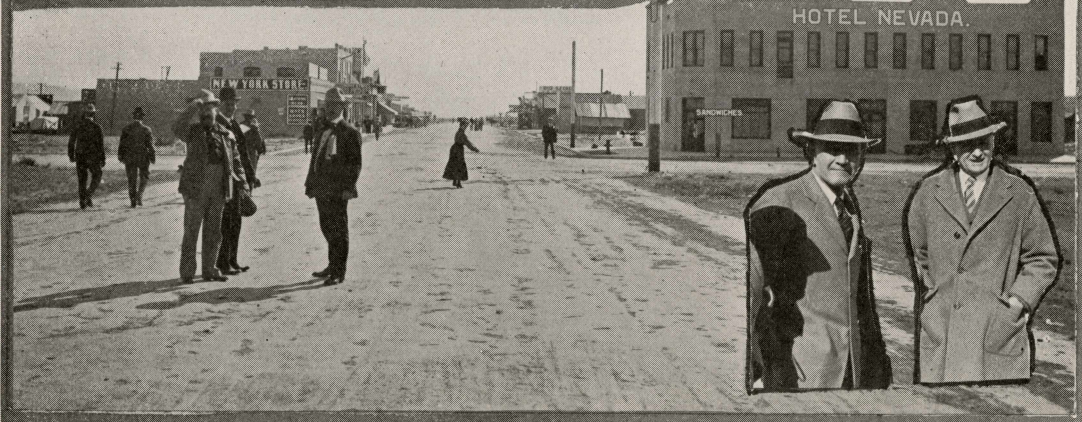
Street Scene Las Vegas, 1929 Street Scene Las Vegas, 1905