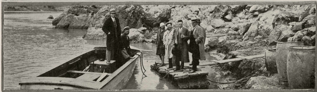
A Conception of the Boulder Dam Area and Las Vegas Valley, Nevada