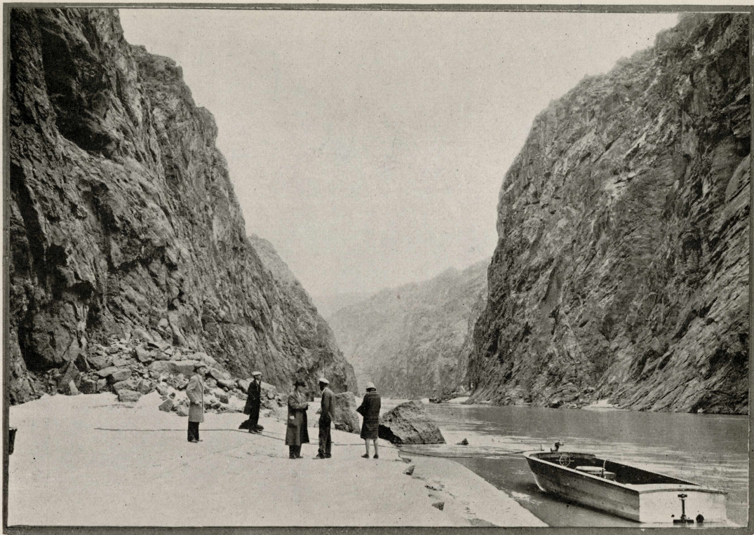
Close-up of Black Canyon Dam Site